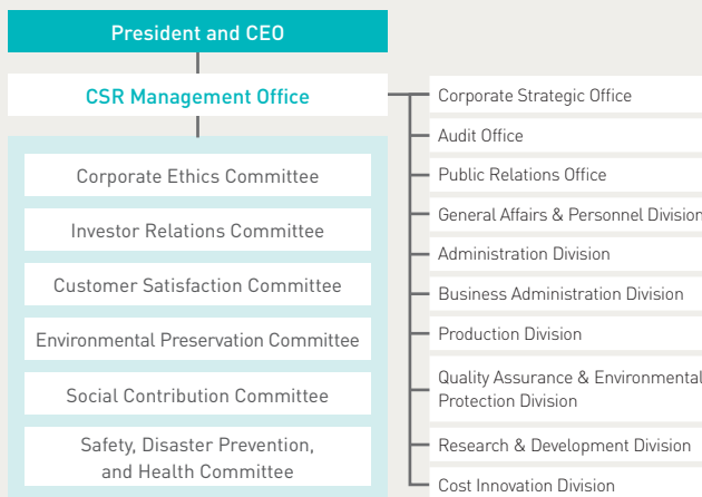
CSR Promotion System As of April 1, 2013

In 2011, LINTEC announced its participation in the United Nations Global Compact. We practice CSR management based on global standards, such as ISO 26000, paying attention to such areas as human rights protection, maintenance of labor standards, environmental consideration, and anti-corruption, with the aim of being a company that is trusted and highly respected by the international community.