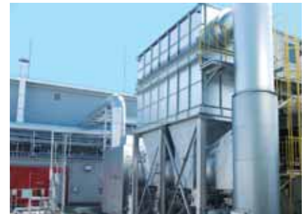
Exhaust-gas treatment facility

The LINTEC Group is striving to reduce the use of organic solvents, such as toluene, in the manufacturing process. In the fiscal year ended March 31, 2013, LINTEC used 7,796 tons of toluene (non-consolidated), a cut of 789 tons compared with the previous fiscal year. We are also working on a transition to a solvent-free release agent used in release papers and a solvent-free adhesive for adhesive papers and films for seals and labels. In the fiscal year ended March 31, 2013, 53% of release papers produced were solvent-free as were 68% of adhesive papers and films for seals and labels sold. Exhaust-gas treatment facilities have been installed in plants as necessary, and we are making efforts to reduce our volatile organic compound (VOC) emissions into the atmosphere.